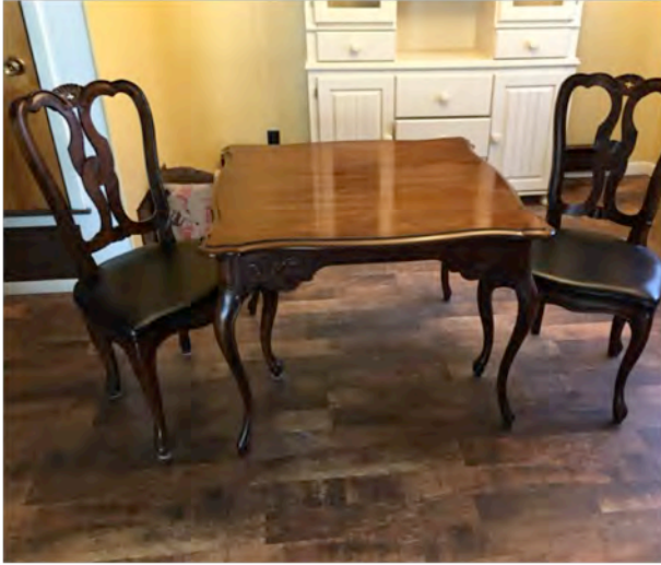
Two 36" Square Chairs $100