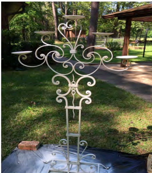
Wedding Candelabra $75